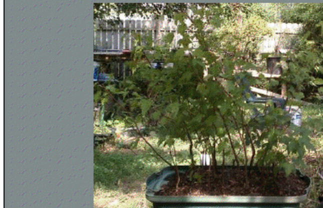
Fig 6: Repotted in shallow tray—3rd year